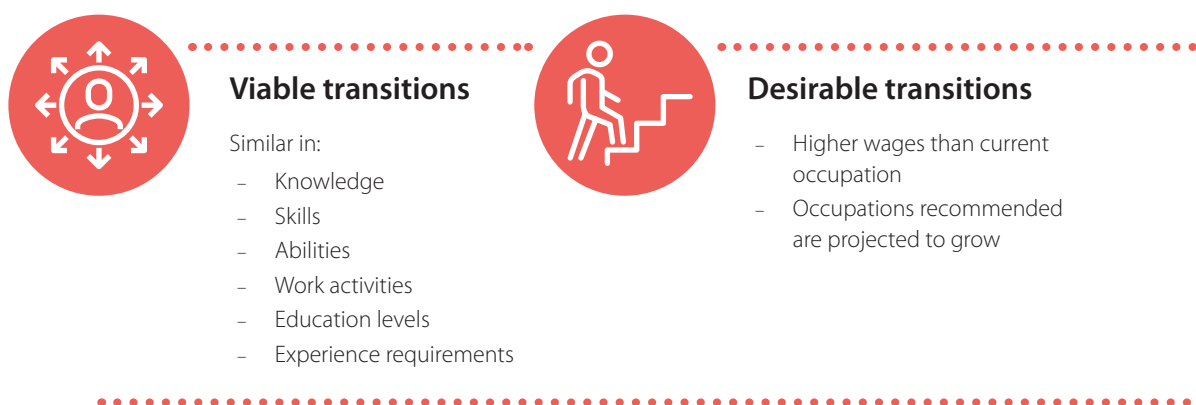
Figure 1. Viable and desirable job transitions