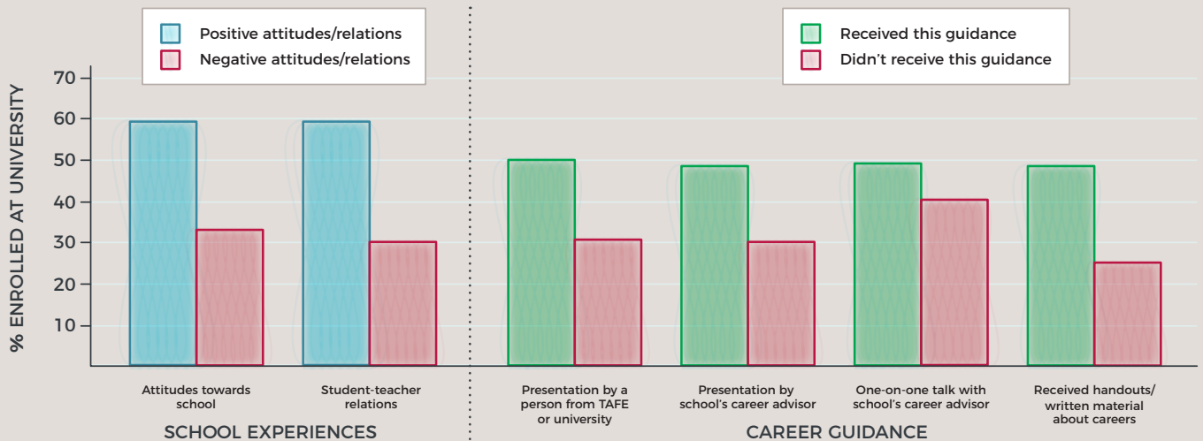
Figure 2. UNIVERSITY ENROLMENT RATES, BY SCHOOL FACTORS

Positive school experiences, good student-teacher relationships and career advice benefit all students